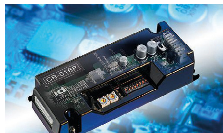
02 The control board allows for the individual configuration of the drive rollers, e.g. in terms of conveying speeds